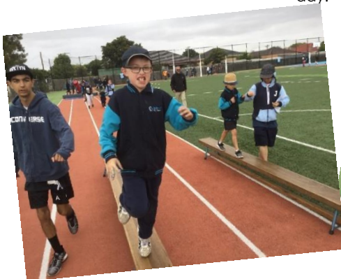
Walk for the West-FUN RUN

Last Friday half of the VCAL students attended a first aid course, learning some valuable skills