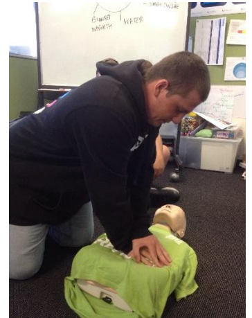
First Aid course

Last Friday half of the VCAL students attended a first aid course, learning some valuable skills