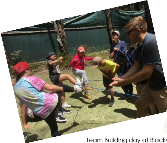
Team Building day at Blackwood.

One the first Friday of term the entire Senior Secondary department went to Blackwood for a day of team Building. Students and Staff had a great day.