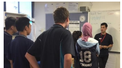
FIT 2 DRIVE

Fit2Drive is a program aiming to reduce youth road trauma. The focus is on helping young people to make good decisions when faced with risky driving situations, whether as a passenger or a driver.